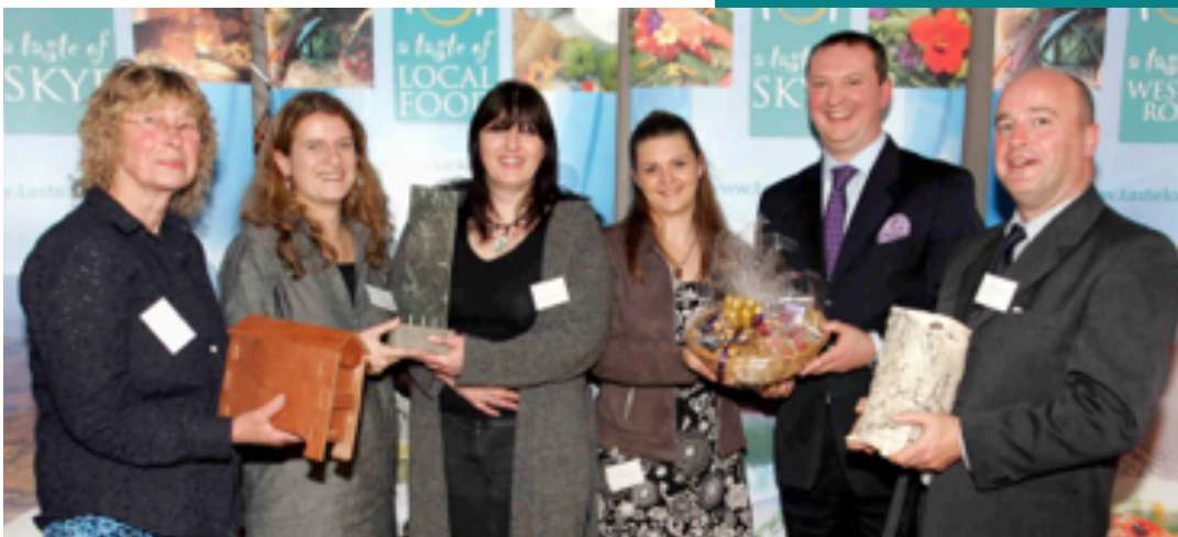
First Awards Ceremony held in 2006.

Winning means businesses can display the Taste Local awards plaque. The plaque lets their customers know they are committed to serving fresh local produce. It also provides them with a peg for their own, year-round, publicity drives.