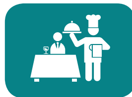
Best Restaurant with Rooms