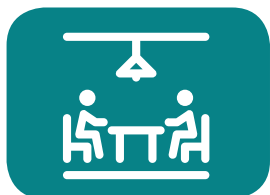
Best Community Café