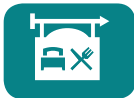
Best B&B or Guest House