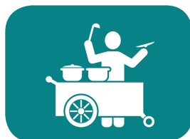
Best Pop Up, Food Event or Takeaway