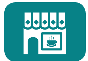
Best Café or Coffee Shop